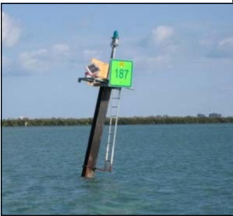
AT LEFT: Damaged day marker. AT RIGHT: VDS practice at station pier.