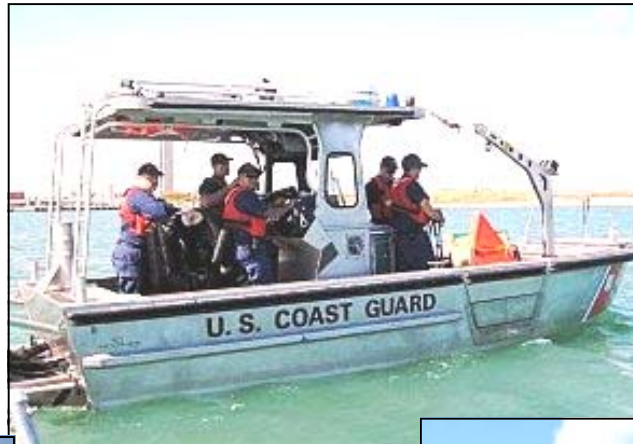
AT RIGHT: Station Fort Pierce ANT boat & crew.